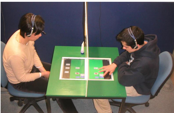
Fig. 1: Corpus collection setup. The instructor on the right moves a card on the touch screen. The learner sees a copy of the move on her

Corpus collection has been described in detail in [7]. We summarize the main points here. We have collected a corpus of 21 instruction dialogues between a human teacher and a human student. The teacher explained the card game Scopa. An initial instruction session was followed by one or two games during which the instructions were refined. We report here on the initial instruction phase. Subjects did not know the selected Italian card game, but had prior knowledge of card games. The setup is shown in Figure 1. The subjects explained the game to each other in a long chain, whereby the last student becomes the teacher for the next student.